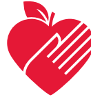
Food + Nutrition