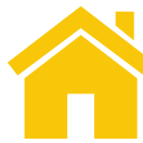
Home + Families