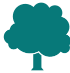
Environmental + Natural Resources